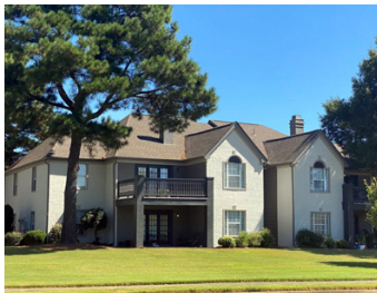
Addison at Collierville Collierville, TN Multifamily - REEV I

Our dedicated team of real estate professionals is available to assist with clients’ external real estate queries.