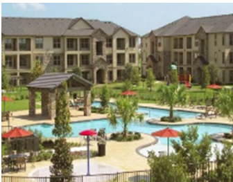
Discovery at Shadow Creek Pearland, TX Multifamily - REIF II