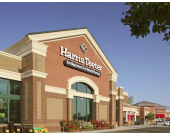
Cary Park Town Center Cary, NC Retail - REIF I