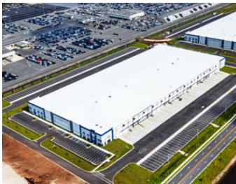
Florida Gateway Jacksonville, FL Industrial - REIF III